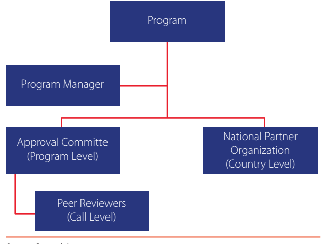
FIGURE 4: Program Details for the WISE Facility

An Approval Committee (AC) for each program comprising regional and international experts (a maximum